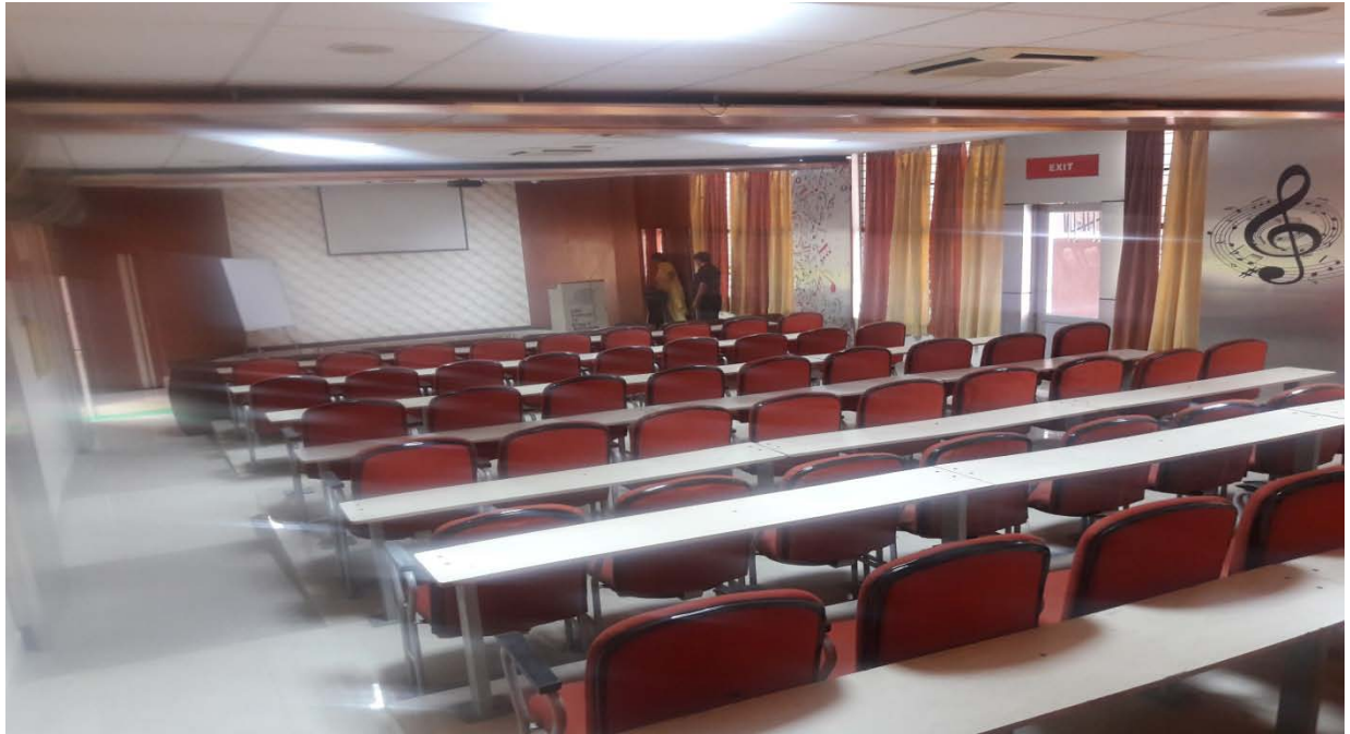
CENTRAL SEMINAR HALL (R&D BLOCK)