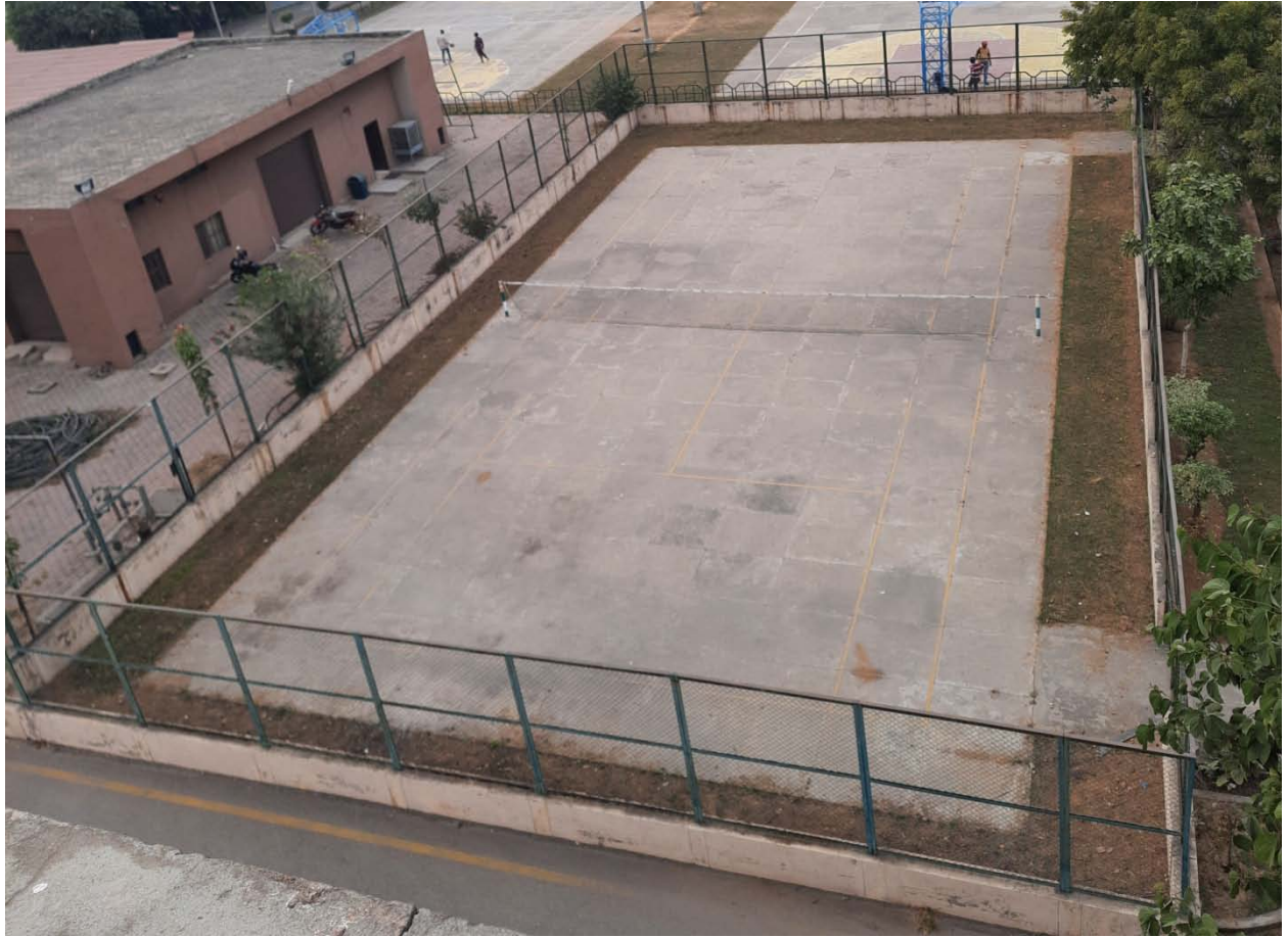
LAWN TENNIS COURT