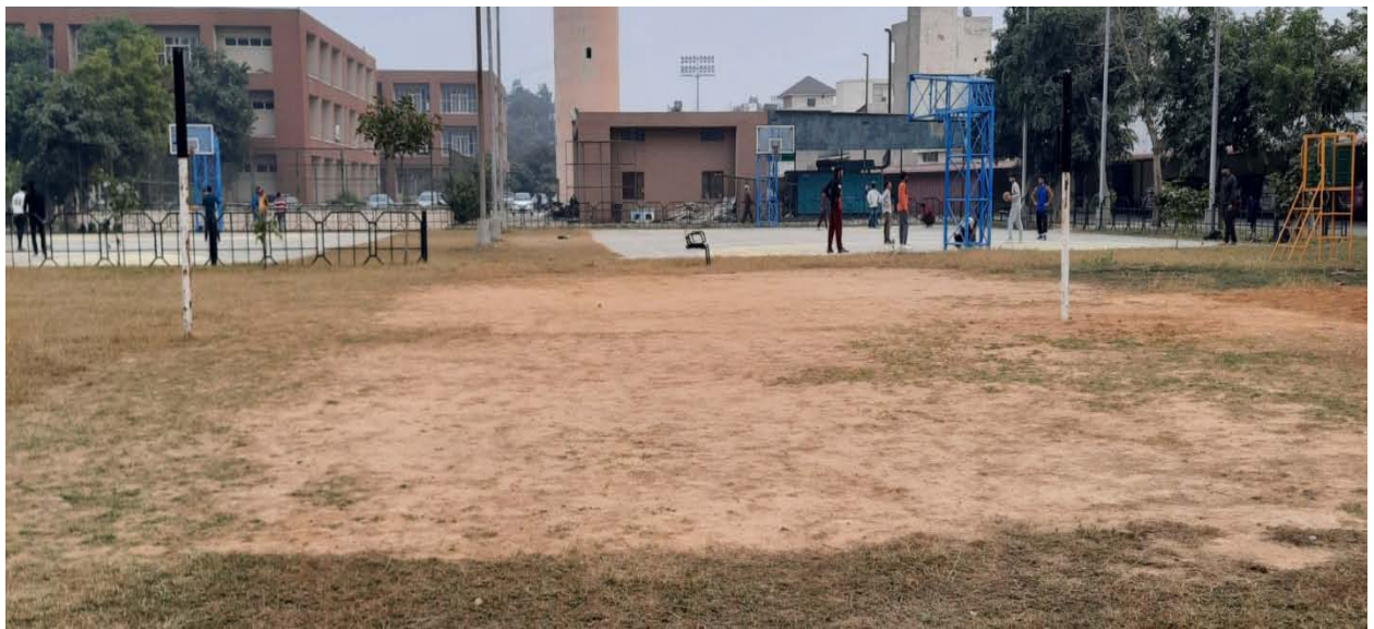
VOLLEY BALL COURT