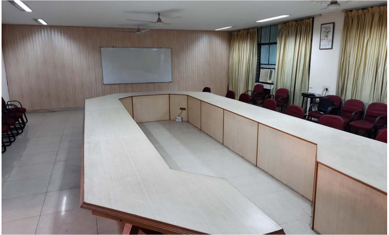
GROUP DISCUSSION ROOM